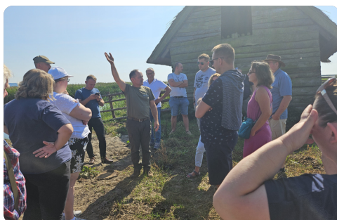
Smolczyński family demonstration farm in Western Pomerania