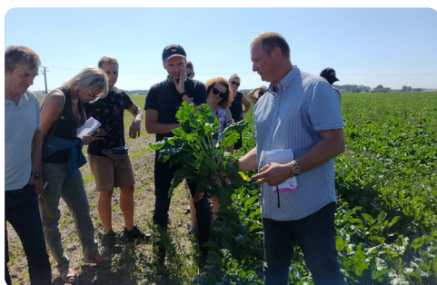
Tarnicki family demonstration farm in Kuyavia-Pomerania – © Agricultural Advisory Centre in Brwinów (CDR)

Click on the pictures to download the high-resolution versions. The pictures are free for use, please mention the copyright ©.