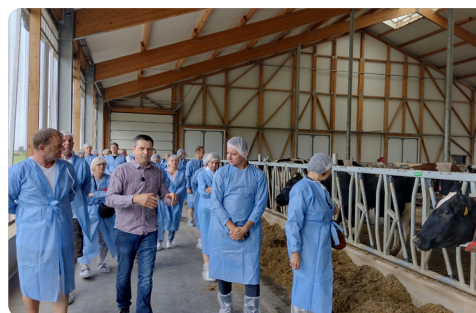
Kawula family demonstration farm in Kuyavia-Pomerania

Please feel free to use this press article and the pictures in your own publications and to inform your colleagues. If you would like to receive all EU CAP Network press articles directly, please fill in the subscription form .