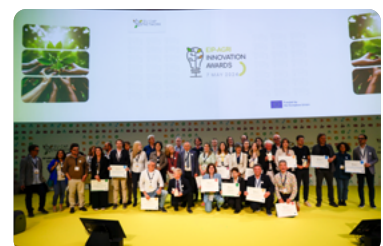
Nominees and winners of the EIP-AGRI Innovation Awards