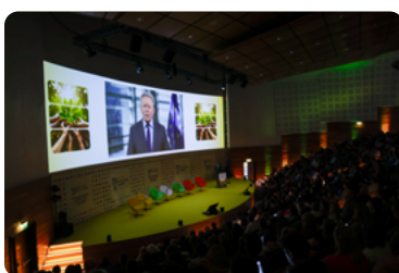
Janusz Wojciechowski, European Commissioner for Agriculture addresses participants at the conference

Click on the pictures to download the high-resolution versions. The pictures are free for use, please mention the copyright.