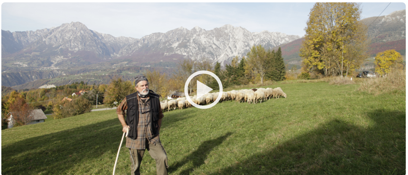
Operational Group: SHEEP-UP - Ovine bio-diversity in Veneto