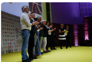
Nominees in the category Business models in food supply chains on stage during the ceremony