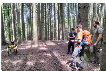
Demonstrating innovations for forestry