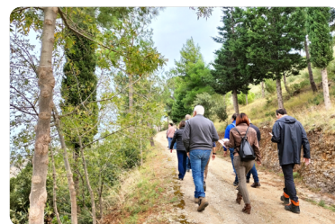
Forestry field trip