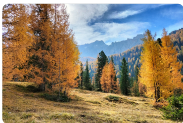
Safeguarding EU forests through the spread of innovative outcomes from Operational Groups

Click on the pictures to download the high-resolution versions. The pictures are free for use. Please mention the copyright.