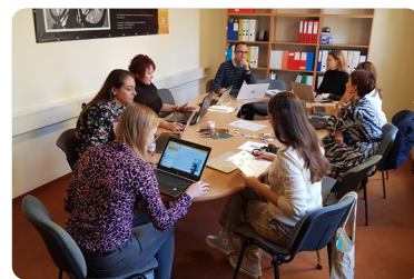
During the last transnational project meeting, the partners discussed and finalised, among other things, the exploitable results and impact analysis of the SAGA project