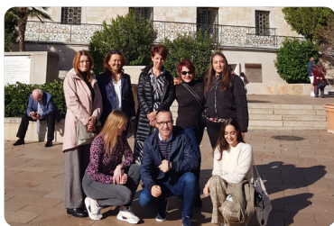
STRIA hosted the last meeting of the project as lead partner. To mark the end of the project, SAGA partners took a photo in the main square of Pécs, Hungary

Click on the pictures to download the high-resolution versions. The pictures are free for use. Please mention the copyright.