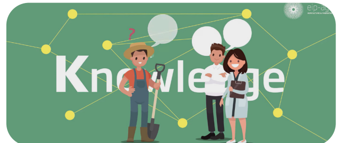
EIP-AGRI Video: AKIS - Building effective knowledge flows across Europe