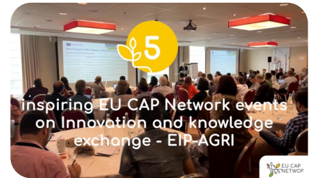
EU CAP Network events on Innovation and knowledge exchange - EIP-AGRI - Spring events 2023