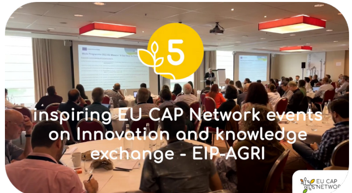
EU CAP Network events on Innovation and knowledge exchange - EIP-AGRI - Spring events 2023