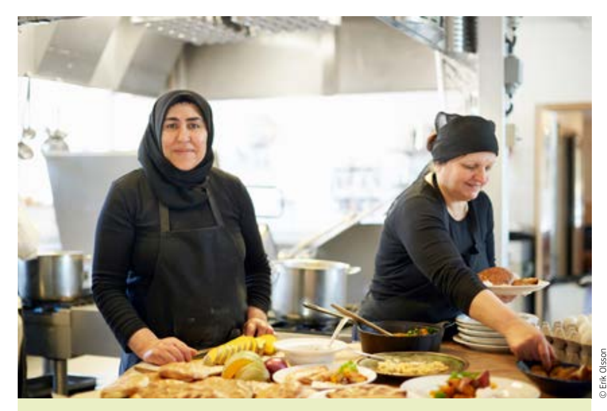
Women from countries including Pakistan and Iraq were able to use their culinary traditions to drive a new social enterprise.

the initiative was too new and unknown for companies in the food sector. At the same time, it was outside of the typical scope of activities of many social organisations. "We ended up in a gap because we were not a traditional food company and not a regular social activity," she argues.