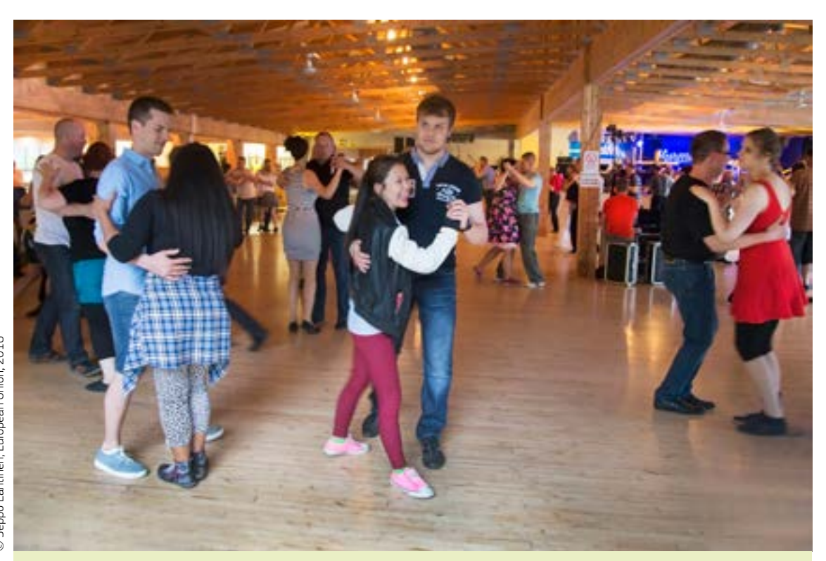
Social events are used to bring communities and individuals together.