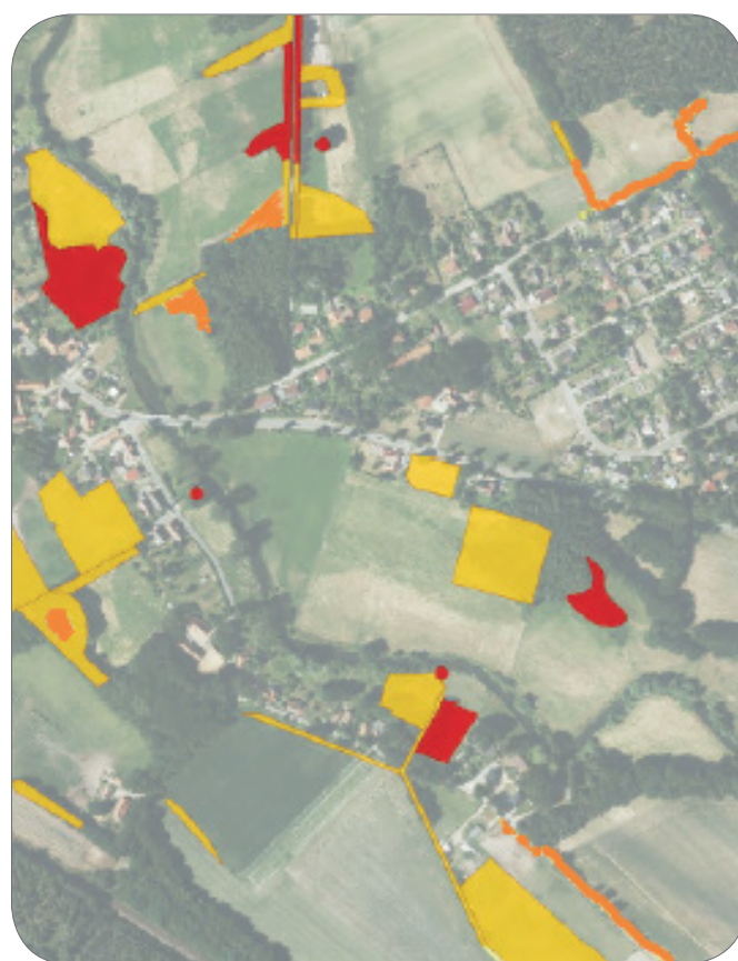
Aerial photo: © GeoBasis-DE / BKG 2016, HNV Farmland data: © Federal States of Germany

Plots with less than 4 character species are regarded as having no high nature value. Landscape elements are assigned to one of the quality levels using structural criteria specific to each type, which are laid down in the field manual.