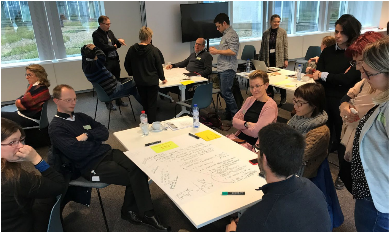
Figure 2. Workshop in Brussels, 30-31 January 2019

A major outcome of the second meeting in Brussels (Fig. 2) was the identification of a top five of new feed options that the Focus Group experts assessed as the most promising - as outlined above (see Table 1). The top five new feed options were: i) Bakery products, ii) Green biomass (grass/clover), iii) Insects (black soldier fly – Hermetia illucens ), iv) Micro-algae and v) Single cell Protein (bacteria).