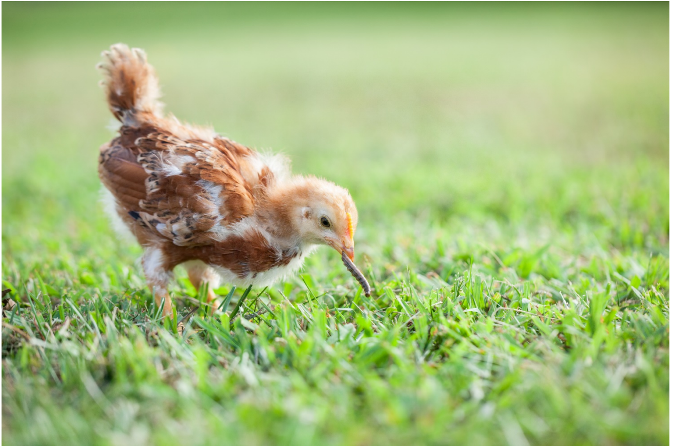
Figure 1. On-farm feeding of poultry with insects

Many of the new feed options likewise have great potential to implement circular economy in the pig and poultry value chains. This may, initially, be most obvious regarding application of industrial residues and former foodstuffs such as bakery products. Here several EU-based companies provide good cases of how using former foodstuffs, e.g. from the bakery industry, in feed supplements for poultry and pigs, can provide a sustainable business and supply. Some of the major challenges for this sector are logistics, including securing relevant products based on transportation costs and volumes available at customers, as well as downstream processing ( e.g. removal of residual packaging). Nevertheless, bakery products are used widely in the EU, particularly for pigs. Good examples also exist for poultry. For instance, the Dutch farm Kipster produces sustainable eggs using a feed based primarily (97%) on leftovers like bakery products.