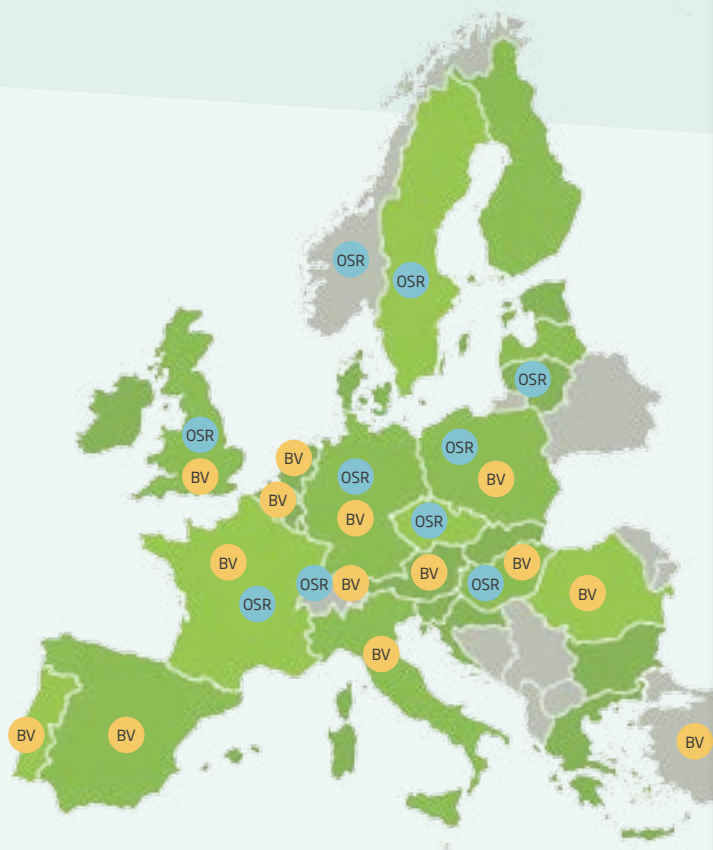
Main oilseed rape (OSR) and Brassica vegetable (BV) producing countries in Europe