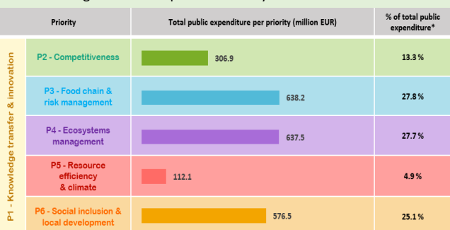
Table 1: Budget allocation per RDP Priority

42% of the rural population will be covered by local development strategies (drawn up by 40 Local Action Groups) under the LEADER approach and 18% of the rural population is targeted to benefit from improved general services and infrastructure. 16% of the rural population will benefit from new or improved broadband infrastructure. The graphics below illustrate the EU priorities, measures and budget allocations of the Lower Saxony and Bremen RDP 2014-20.