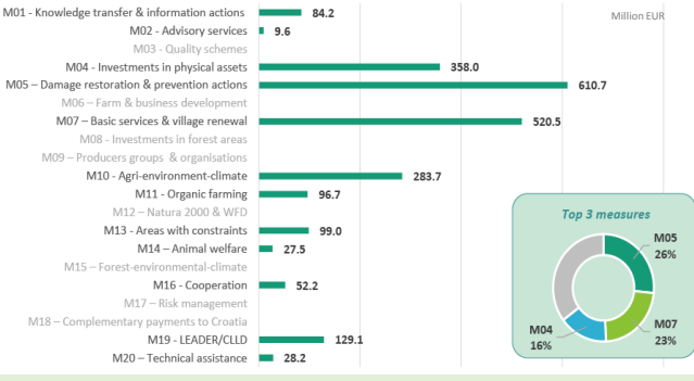
Table 2: Budget allocation per RDP Measure