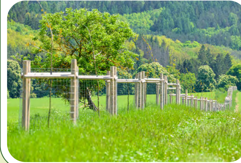
Restoration and planting of linear greenery and agroforestry