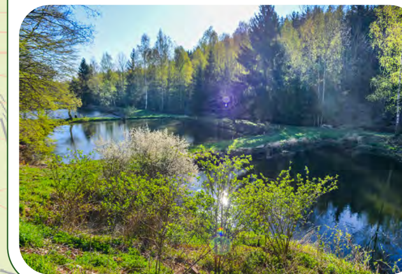
System of experimental ponds