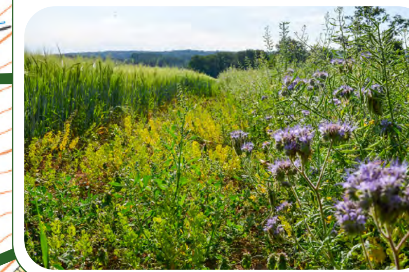
Biodiversity strips and hedgerows