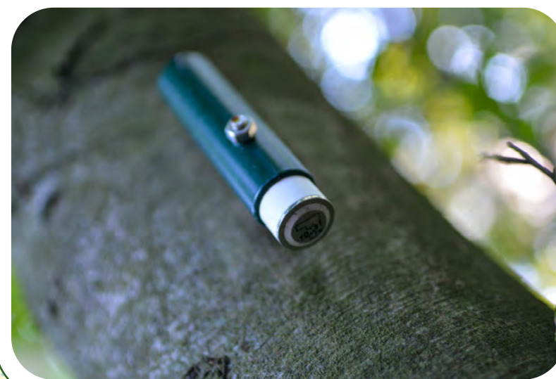
Forrest monitoring system