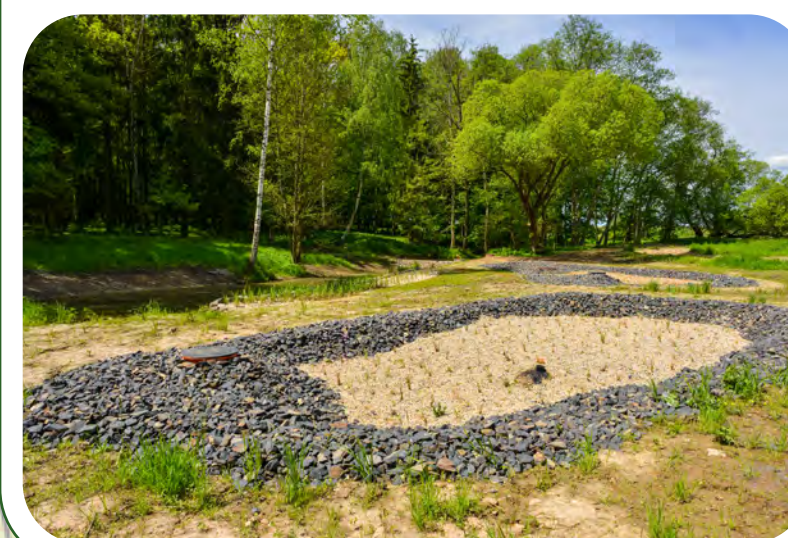
System of experimental wetlands