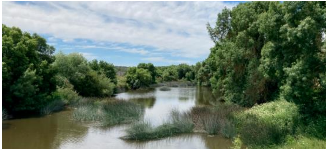
riparian galleries in a river