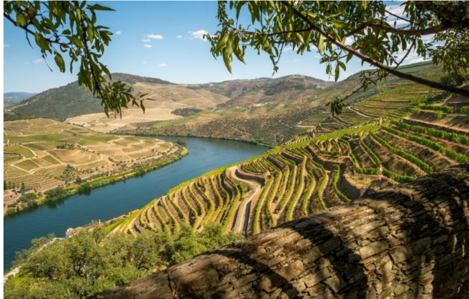
stone support walls