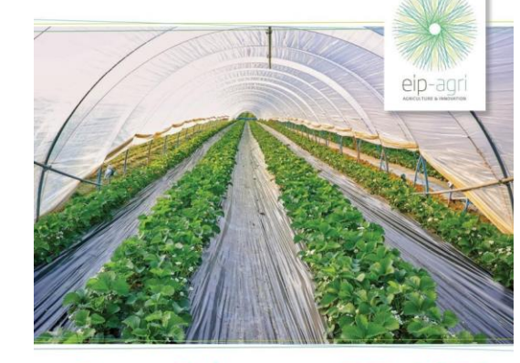
Grupa Fokusowa EIP-AGRI Zmniejszenie śladu plastikowego w rolnictwie

b) invitation of individual participants in the groups' work to network events at the national or regional levels