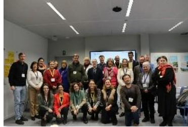
Second in person TG meeting (16 January 2024)