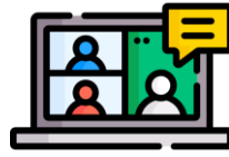
Two informal online meetings