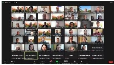
First online TG meeting (9 October 2023)