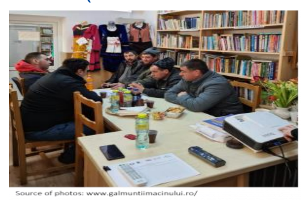
Local governance participation in decision making