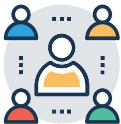
Meeting 1 (9 October 2023)