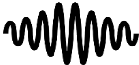
Interaction and work in-between meetings