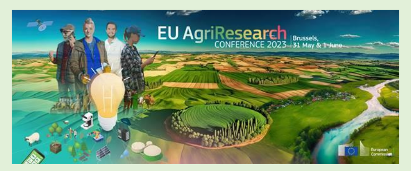
More information <u>here</u>