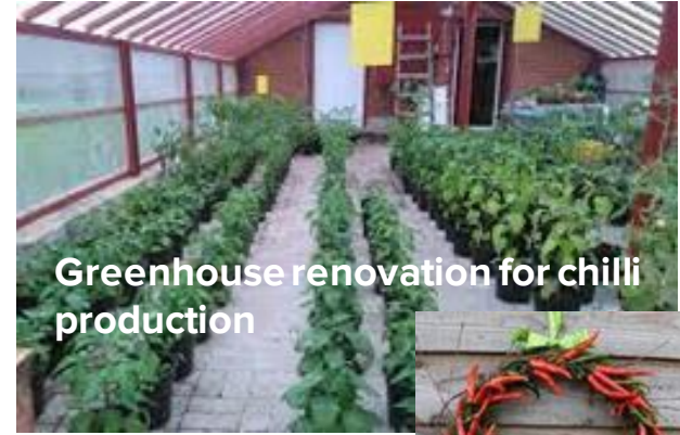
Greenhouse renovation for chilli production