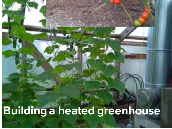
Building a heated greenhouse