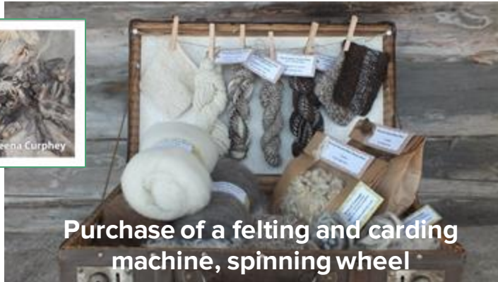
Purchase of a felting and carding machine, spinning wheel