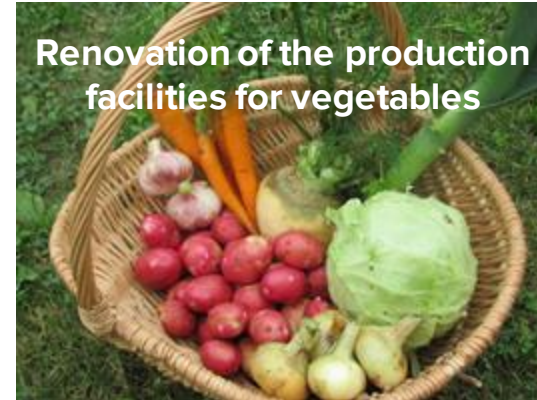
Renovation of the production facilities for vegetables